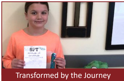
Transformed by the Journey